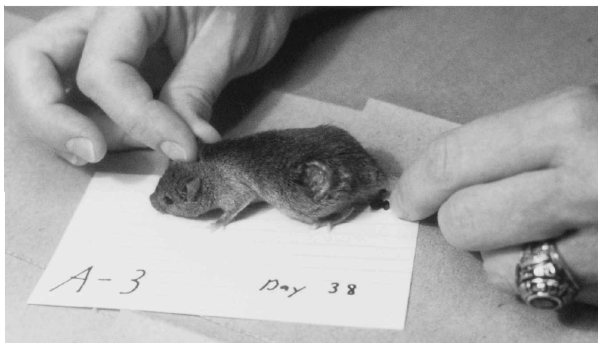
Fig. 5. Thirty-eight days after injection.

Figure 1 (Day 14), the tumor is visible on the left posterior dorsal aspect of the mouse.