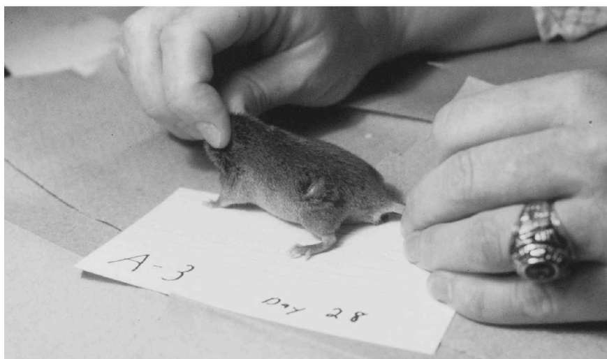
Fig. 3. Twenty-eight days after injection.

cases, the ulceration grew extremely large (Figure 5) then appeared to implode (not shown), and the wound closed. The mice then lived their normal life span of approximately 2 years. In the figures, the index card notation "A-3" identifies the mouse, and the day number indicates elapsed time since injection. In