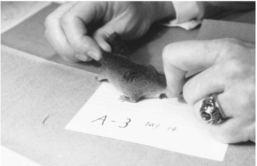
Fig. 1. Typical mouse 14 days after injection.

mors (Figures 1 and 2). At this point, Bengston presumed that the experiment was failing and wanted to call it off. Krinsley convinced him to continue, reasoning that there was nothing to lose. Approximately 1 week later, the blackened areas "ulcerated" as if they had been split open (Figures 3 and 4). In some