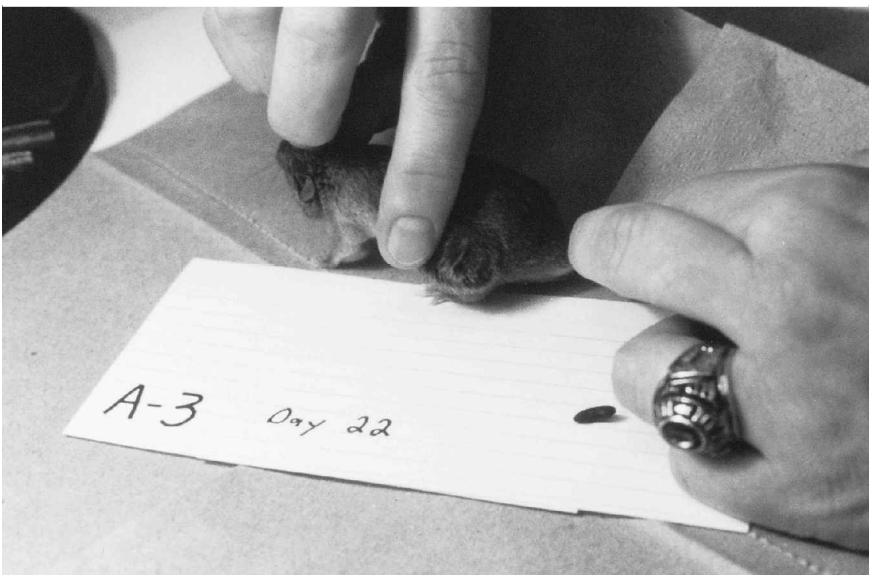
Fig. 2. Twenty-two days after injection.

mors (Figures 1 and 2). At this point, Bengston presumed that the experiment was failing and wanted to call it off. Krinsley convinced him to continue, reasoning that there was nothing to lose. Approximately 1 week later, the blackened areas "ulcerated" as if they had been split open (Figures 3 and 4). In some