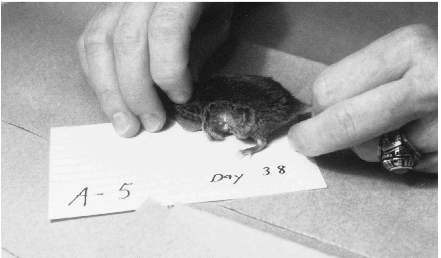
Fig. 6. Example of large ulceration.

Some of the ulcerations grew extremely large (Figure 6), yet no mouse ever developed any gross signs of infection, even when the size of the ulceration alone should have been enough to kill it. Finally, and perhaps most persuasively, we were unaware that the experimental biologist at St. Joseph's College had reinjected several remitted mice months after the experiments were over. Without further treatment, these mice were immune to the mammary adenocarcinoma.